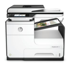
HP PageWide Pro 477dn Multifunction Printer

Ultimate value and speed—HP PageWide Pro delivers the lowest total cost of ownership and fastest speeds in its class.<sup>1,2</sup> Get quick two-sided scanning, plus best-in-class security features and energy efficiency.<sup>3,4</sup>