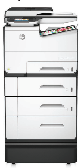
HP PageWide Pro 577z Multifunction Printer